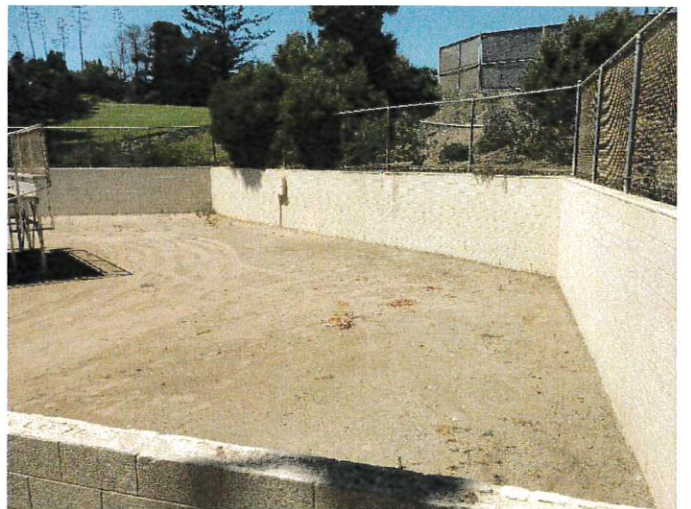
Bonito Canyon Park