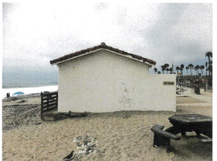
North Beach restroom/concession building