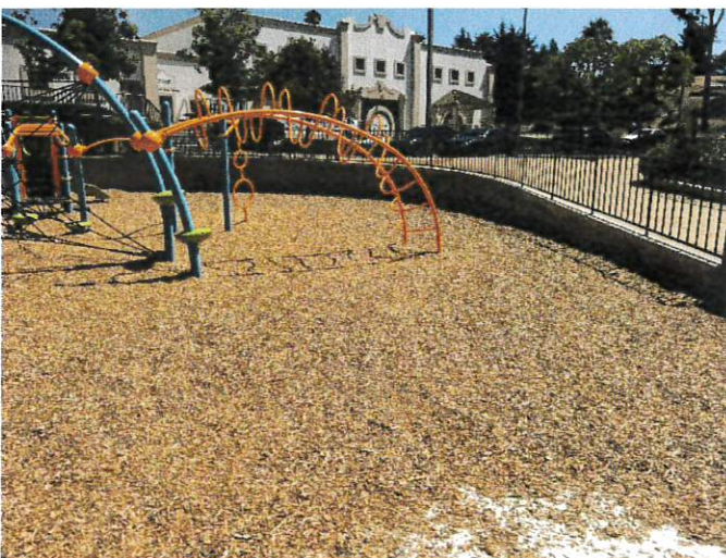
Bonito Canyon Park