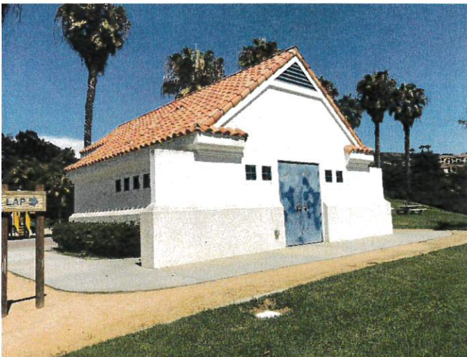
Rancho San Clemente Park