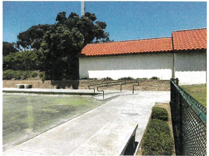
San Luis Rey Park